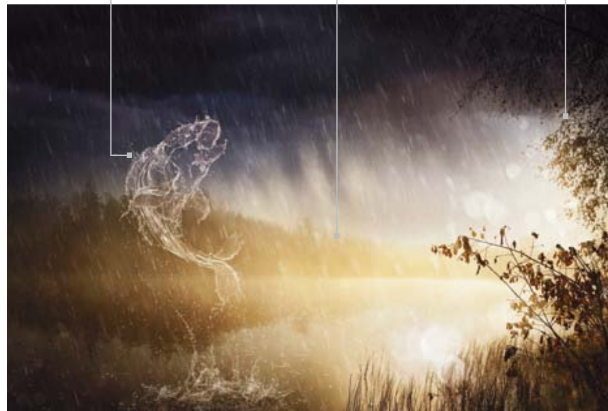
002 There is a high contrast between the beautiful golden glow emanating from the right of the image and the dark surrounding the left. This use of contrast creates the impression of a warm, rising sun on a rainy day.